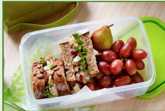
The Gobbler Sandwich