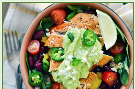
Cali Fresh Turkey Bowl