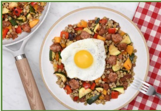
Hearty Turkey and Lentil Breakfast Bowl